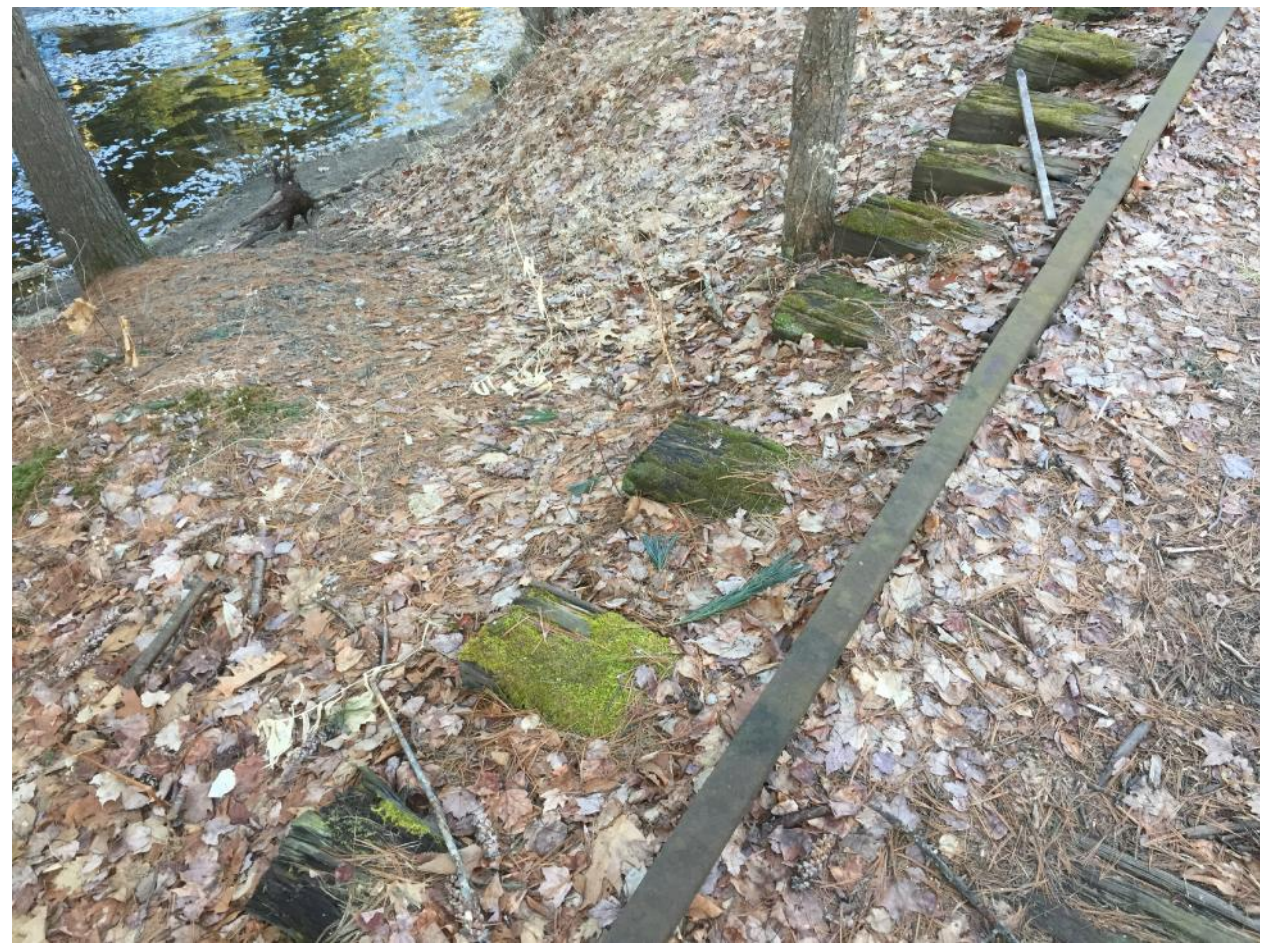
Area 1, Erosional swale leading down to river and undercutting rail bad