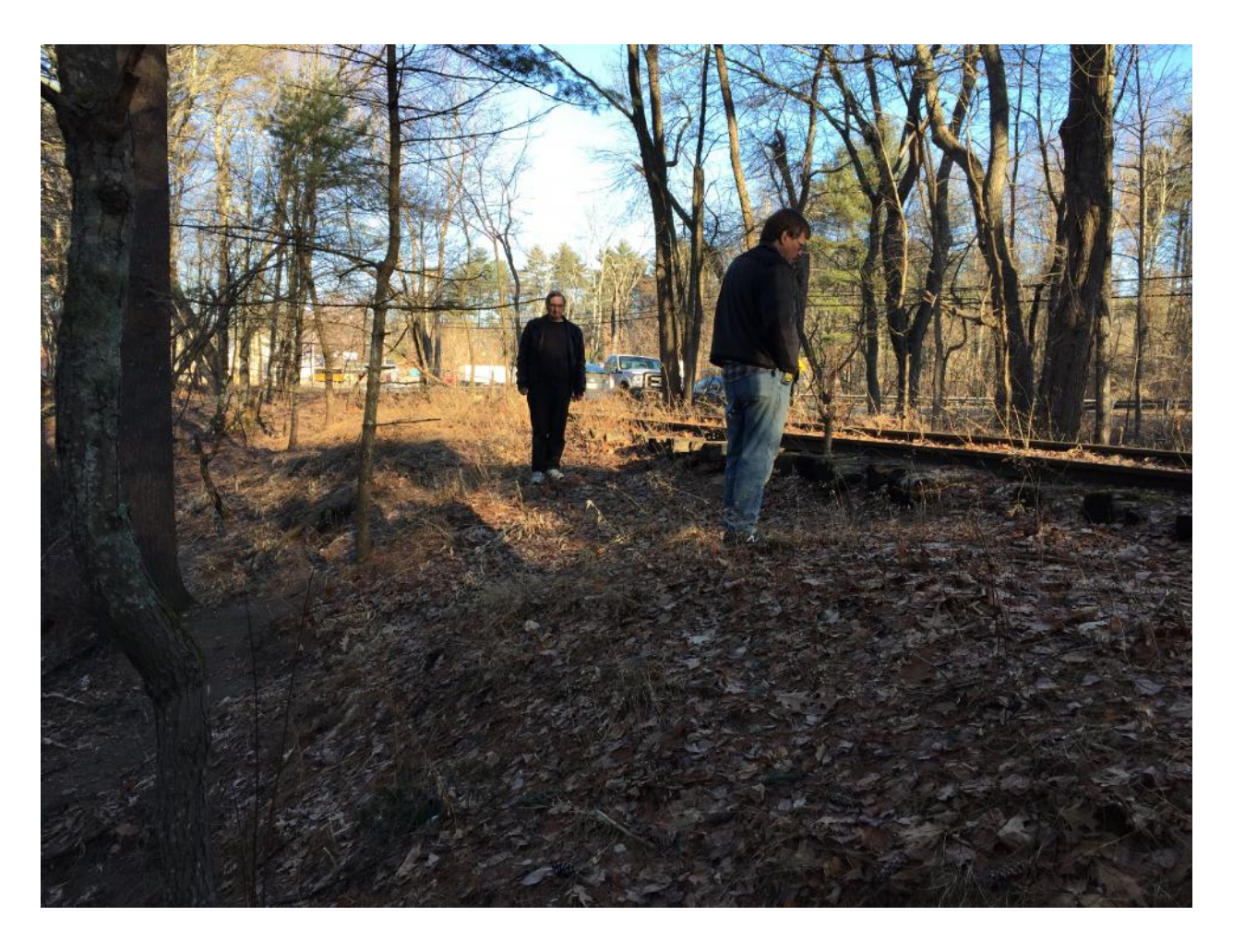
Example proposed barrier location, end points marked by two individuals