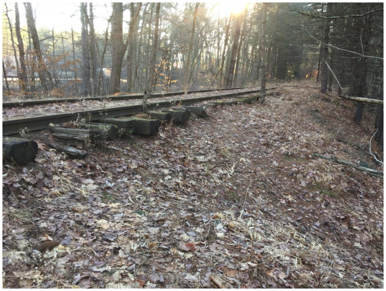
Looking parallel to rail bed in same area