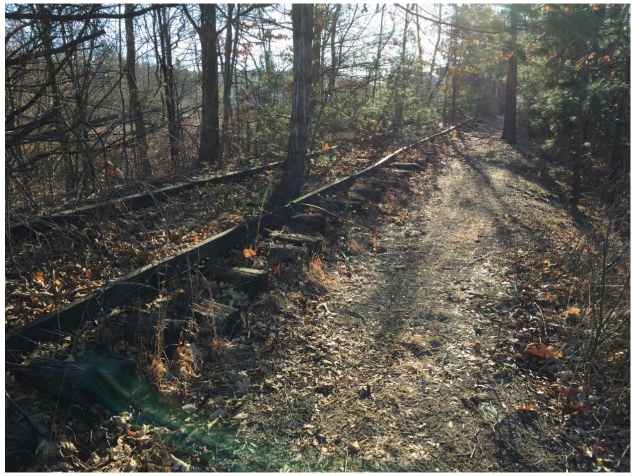
Second location looking east