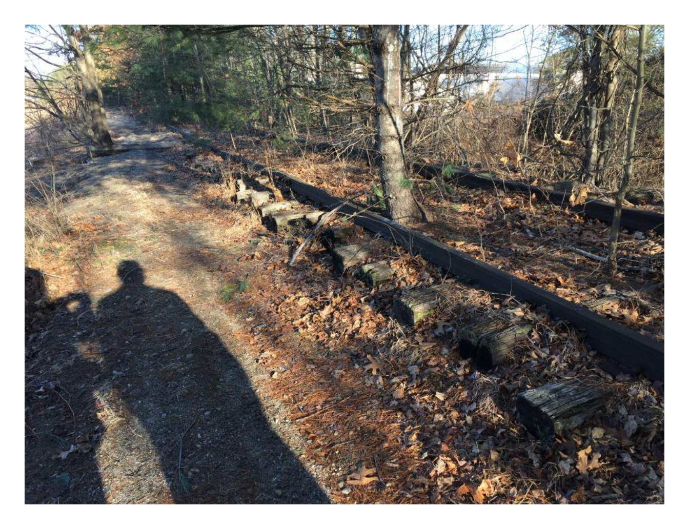
Second location just west of Sterilite, looking west.